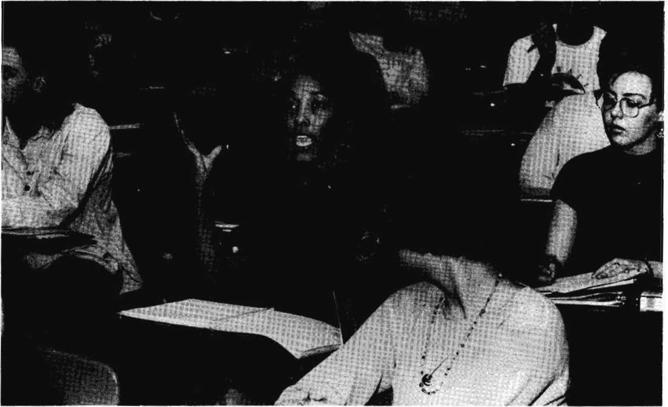
Students in Seattle Central Community College's coordinated studies program, "The Global Village."