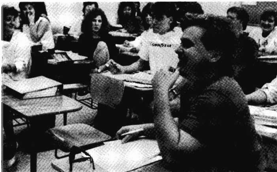
Students join in discussion in "The American Character," Spokane Falls Community College's coordinated studies program offered Spring Quarter, 1989.