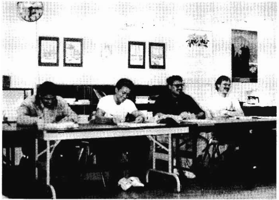
Students at Monroe Reformatory participating in the Antioch University pilot class in social philosophy.