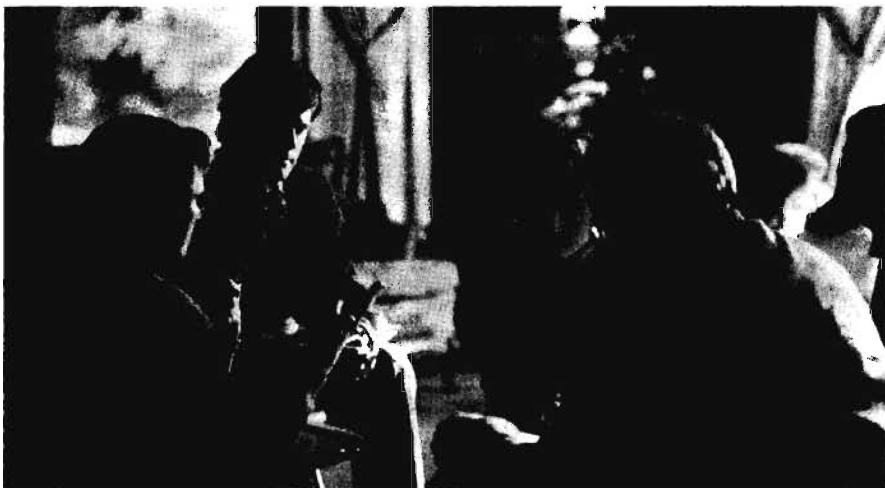
Faculty members and administrators from eastern Washington campuses at last spring's annual curriculum planning retreat, held at Gonzaga University's Bozarth Center.

Another recent version of linked classes has developed as a student success strategy. Reaching out to poorly prepared students and student athletes, as well as to regularly admitted students, both Washington State University (WSU) and University of Washington (UW) are linking study skills classes to large, demanding lecture classes. WSU's Student Advising and Learning Center staff is linking study skills classes to seven different courses and has added a teaching assistant component to many of these classes as well. UW's Educational Opportunity Program is linking similar classes to introductory courses in psychology and sociology, and is targeting the links to students of color and nontraditional students as a strategy for adding a collaborative learning element in its very large lecture courses.