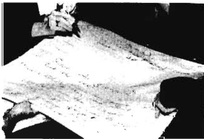
Working with large pads is a great way to help groups focus, especially on hard issues.

Cases that members of the Washington Center have been writing and field testing are different from cases in law or medicine. The purpose of the Washington Center cases is to encourage conversations about issues in education which uncover insights about teaching and learning. These cases can be used with faculty and administrators, sometimes with students, resulting in various interpretations due to perspective. Consequently, our cases have no “correct” answer; however, over the past five years, we have experimented and developed a sequence in working the cases which seems to be helpful in guiding the discussion around teaching and learning.