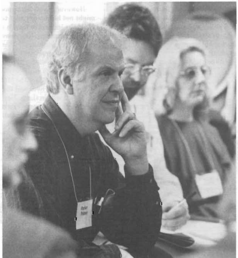
Parker Palmer listens to comments in his session on “A Movement Model of Educational Reform” at the Washington Center’s conference on collaborative learning.

If we change the curriculum, it makes sense that we are also changing who we are, and the direction our lives will take.